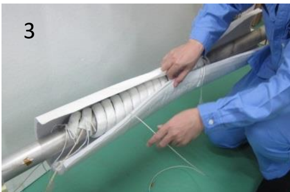
3 Finally our Jacket form made of melamine sponge will optimize the use of ribbon heater