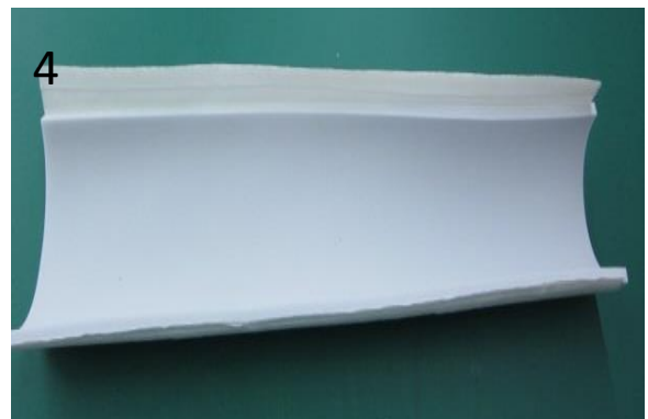
4 Jacket Form made of melamine sponge